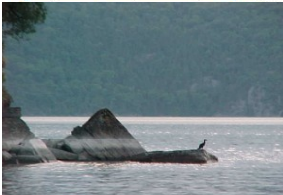
[caption id="attachment_1869" align="alignnone" width="397" caption="CONVERSE BAY"]